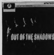
Columbia SCX3449 (stereo LP) 33SX1458 (mono LP)