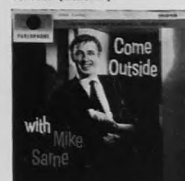
Pariophone PMC1187 (mono LP)