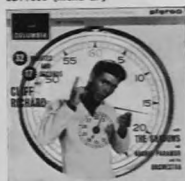
Columbia SCX3436 (stereo LP) 33SX1431 (mono LP)