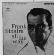
Capitol SW1538 (stereo LP) W1538 (mono LP)