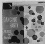
H.M.V. CSD1463 (stereo LP) CLP1597 (mono LP)