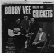
Liberty SLBY1085 (stereo LP) LBY1085 (mono LP)