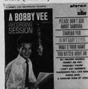
Liberty SLBY1084 (stereo LP) LBY1084 (mono LP)