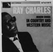
H.M.V. CSD1451 (stereo LP) CLP1580 (mono LP)