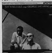
Capitol SW1675 (stereo LP) W1675 (mono LP)