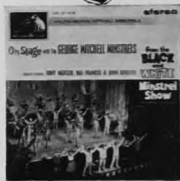
H.M.V. CSD1467 (stereo LP) CLP1599 (mono LP)