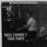
Columbia SCX3458 (stereo LP) 33SX1464 (mono LP)