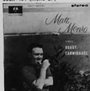
Pariophone PCS3634 (stereo LP) PMC1185 (mono LP)